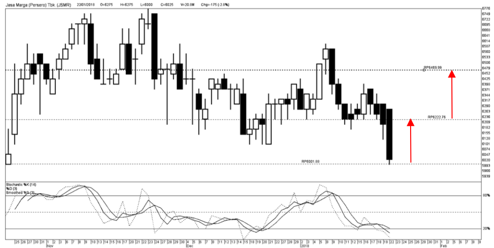
Kinerja saham JSMR

Danareksa research report are also available at Reuters Muxtex and First Call Direct and Bloomberg